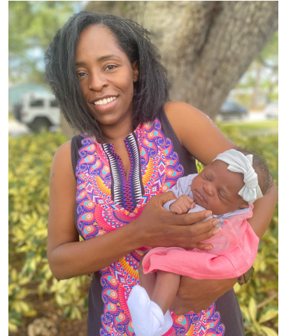
"I FEEL SO COMFORTABLE HERE"

"I highly recommend Care Net Pregnancy Center to all moms-to-be or moms who already have their babies. I love being part of Care Net, they have helped me clear up doubts about breastfeeding and introduction of solids. On each visit you can go to their little store that has incredible things for the little ones. The excellent attention characterizes them. Do not be afraid that you do not speak English, you will find staff who can assist you in Spanish and give you a great welcome." - Client