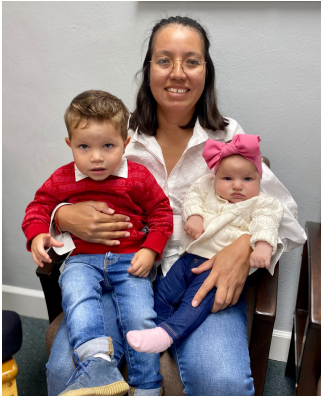
"VERY WARM AND WELCOMING"