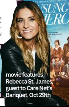
movie features Rebecca St. James, guest to Care Net's Banquet Oct 29th

CARE NET Pregnancy Center of Indian River County